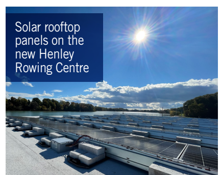
Solar rooftop panels on the new Henley Rowing Centre

The 2022 Canada Summer Games are taking place from August 6 to 21, 2022, and Alectra Utilities will be there as the Official Energy Supplier . The new Henley Rowing Centre (HRC) on Henley Island in St. Catharines is a fully accessible, world-class training facility, with a rooftop solar energy system installed by Alectra. This solar-powered system will produce about 43,000 kWh of renewable electricity each year, which will offset the HRC's energy requirements and allow it to operate at net zero. We're proud to support the legacy and opportunity these Games will bring to the community for years to come. See more ways we're leading the transition to net zero at: Alectra.com/Grid-Innovation