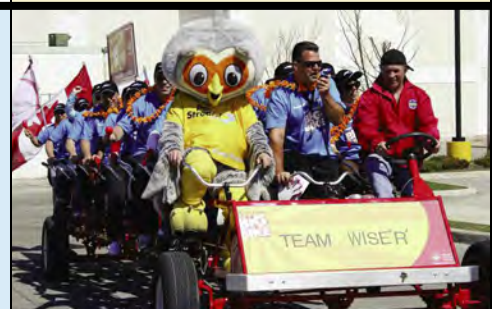
PowerStream employees participating in Heart & Stroke Big Bike event

The company also provides support in the delivery of conservation programs and environmental initiatives that assist customers in